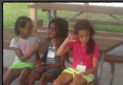
Mmm...S'mores while fellowshiping.