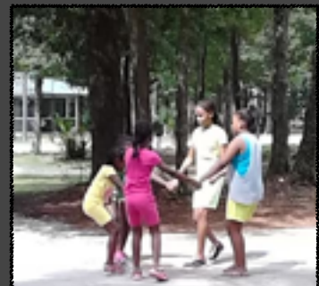
Performing arts class perfecting their moves!