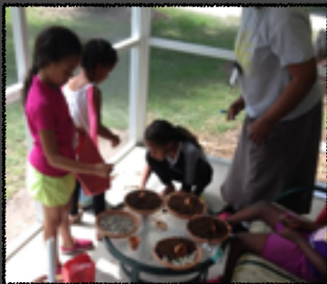
Campers working on their projects in Nature class.